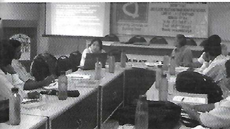
Jharkhand SC meeting August 6, 2007