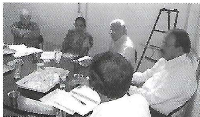
Karnataka State Committee Meeting, November 2007