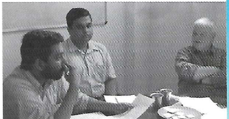
Karnataka State Committee Meeting Bangalore, November 2007