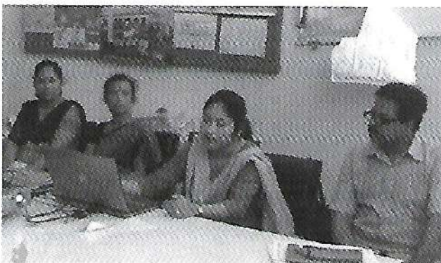
Promotional meeting in Deoghar Aug 7 2007

Registered Office: B-32, Tara Crescent, Qutab Institutional Area, New Delhi- 110016